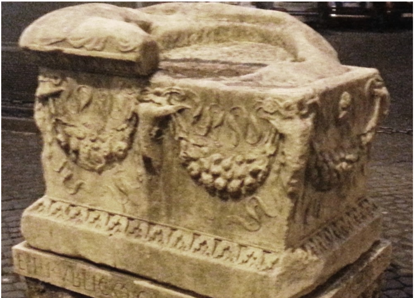
TABLE - BANQUET (Ara)

The banquet is transformed into a sacred domestic ritual of communion with the divine, and the table becomes an altar. Ploutarchos ( “Quaestiones Romanae” , 64) reminds us that the